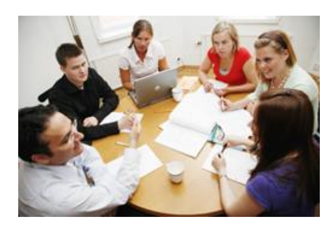
Students teamwork

Invest for Excel® is installed on the server and made available to students on the university workstations and also own PC's, so that students can have access to software when needed. The program is first introduced to students during one hour lecture, while the presenter solves the investment case study step by step and shows the main features. As the tool is intuitive, such a presentation sufficiently prepares students for individual work. The task is to solve a case study of investment individually in Invest for Excel® and to print out the reports and findings with conclusions. The task involves building the cash flow model of an investment, analysis of financial statements, profitability analysis, sensitivity, break-even on various parameters and comparisons with other alternatives. If needed, students get assistance from a support person who is often present in the classroom and assists students with questions regarding software features.